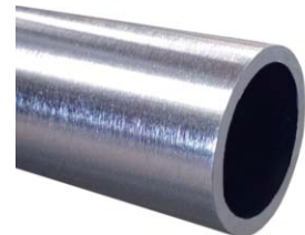
Lite Brushed and Bright Dipped