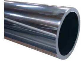
Polished and Bright Dipped