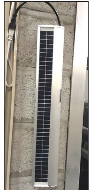
8' Motor Cable