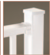
Series 300 Soft curves of this railing system work to conceal the amazing strength inside