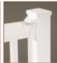
Series 200 Add real architectural appeal with the strong shadow lines of the T-Rail system