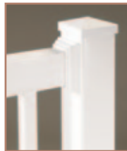
Series 100 2" x 3.5" railing is contemporary and straightforward

The Enrail vinyl railing system is engineered for a higher standard of living, so you can trust your rail for a lifetime of performance and good looks. Enrail is more than just durable, sturdy and safe. You receive the perfect complement to your home's architectural style with ultimate flexibility of design options. Enrail vinyl railing also meets or exceeds stringent AC10 and AC174 standards, and is CCRR-0144 approved. Available in three handrail styles (at right).