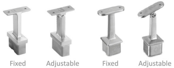
Fixed Adjustable Fixed Adjustable