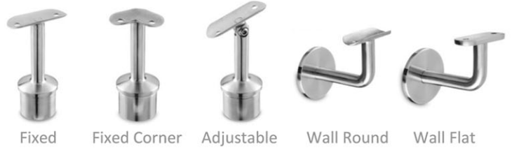
Fixed Fixed Corner Adjustable Wall Round Wall Flat